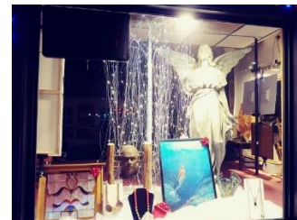
Aberdeen Art Center Holiday Window

200 W. Market Street Aberdeen, WA 98520 www.harborartguild.com www.facebook.com/harborartguild Adoorproject.com