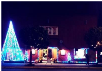
Aberdeen Art Center