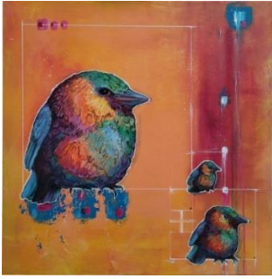
Acrylic Painting by Marshelle Backes