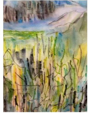
Watercolor by Carole Cohen

200 W. Market Street Aberdeen, WA 98520 www.harborartguild.co www.facebook.com/harborartguild Adoorproject.com