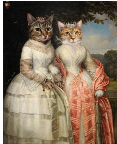
Cats as nobility by Galina Bugaevskaya