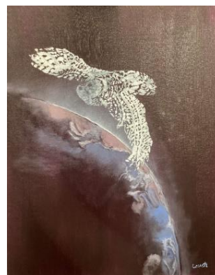
Study for "The Embrace" by Laveta Bowen