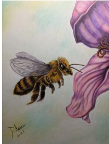
Drawing by Donn Angel

200 W. Market Street Aberdeen, WA 98520 www.harborartguild.com www.facebook.com/harborartguild Adoorproject.com