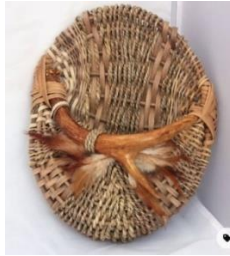
Basket by Arlene Eubanks

200 W. Market Street Aberdeen, WA 98520 www.harborartguild.com www.facebook.com/harborartguild Adoorproject.com