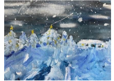
Watercolor by Carole Cohen

200 W. Market Street Aberdeen, WA 98520 www.harborartguild.co www.facebook.com/harborartguild Adoorproject.com