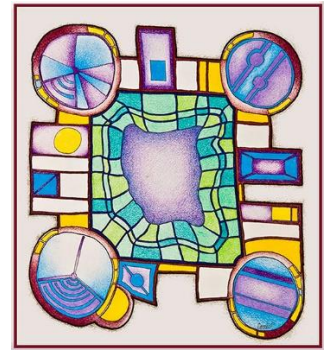
Art by Cassie Andre

200 W. Market Street Aberdeen, WA 98520 www.harborartguild.co www.facebook.com/harborartguild Adoorproject.com