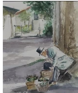
Art by Sue Lowatchie