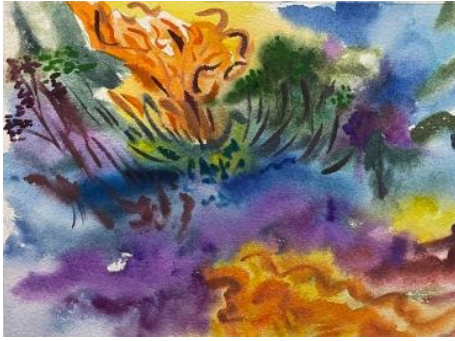
Watercolor by Carole Cohen