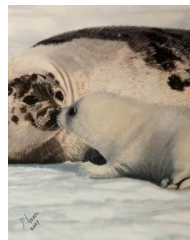
Watercolor by Donn Angel