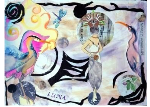
Collage by Nancy Farrar Coughlin

200 W. Market Street Aberdeen, WA 98520 harborartguild.com facebook.com/harborartguild aberdeenartcenter.com/rain-glow ghostproject.art