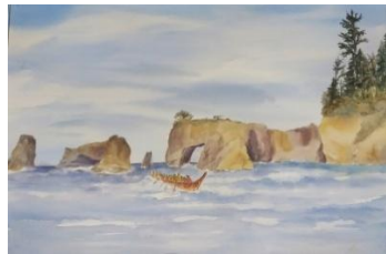
Watercolor by Sue Lowatchie