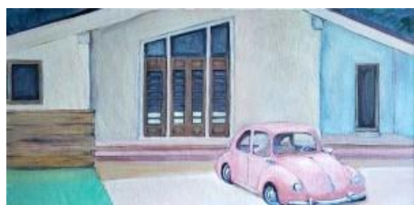
Painting by Marshelle Backes