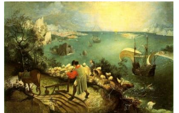
Landscape with the Fall of Icarus - Pieter Bruegel the Elder 1558

In Bruegel's Icarus . . . how everything turns away Quite leisurely from the disaster; the plowman may Have heard the splash, the forsaken cry, But for him it was not an important failure; the sun shone As it had to on the white legs disappearing into the green Water; and the expensive delicate ship that must have seen Something amazing, a boy falling out of the sky, Had somewhere to get to and sailed calmly on.- W. H. Auden