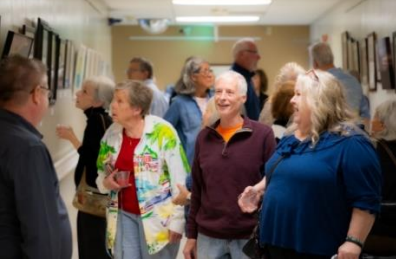
The opening reception