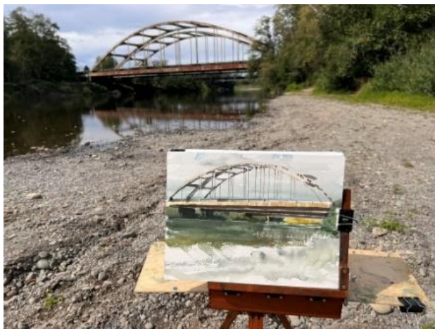
Plein Air watercolor by Rick Woods