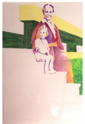
Acrylic by Rich O'Donnell

200 W. Market Street Aberdeen, WA 98520 www.harborartguild.co www.facebook.com/harborartguild Adoorproject.com