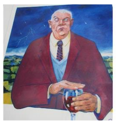
Portion of poster for wine festival in Illinois from 1993 by Eric Faramus

On the very day that I heard that Eric had died, I was on the website Etsy, and on the top row of some art for sale was a signed, limited edition poster by Eric Faramus from 1993! Of course coincidences happen all the time . . . but when I saw this, it seemed like a sign. It is now mine. Perhaps it was simply algorithms that brought the poster into my view on Etsy but it felt "meant to be." I do not remember why I logged onto Etsy that day. I do not recall what I was looking for.