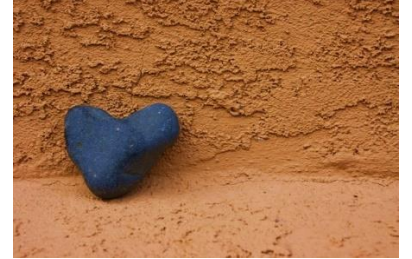
Heart of Stone

ArtsWA has an Emerging Organizations Grant available for general operating expenses in the amount of $2,000-$5,000. Deadline is February 27<sup>th</sup> at 5:00 p.m. <a href="https://www.4culture.org/listings/emerging-organizations-grant/">https://www.4culture.org/listings/emerging-organizations-grant/</a>