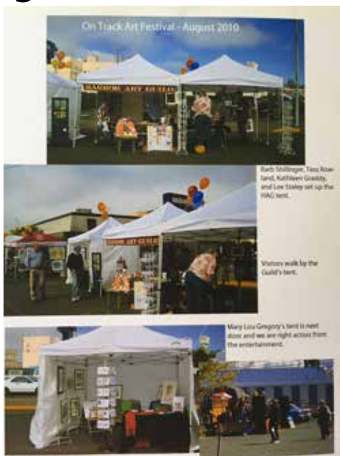
A page from the scrapbook in 2010.

In June 2009 we held our first art supplies yard sale. This continued for many years though the art materials became less plentiful and usual yard sale stuff increased. Proceeds