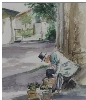
Art by Sue Lowatchie