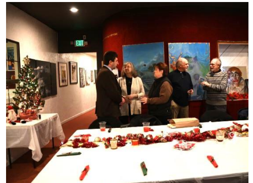
A Group of Us