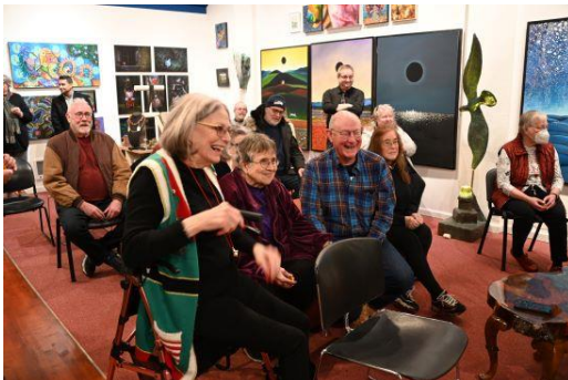
Laughter during the White Elephant Gift Exchange