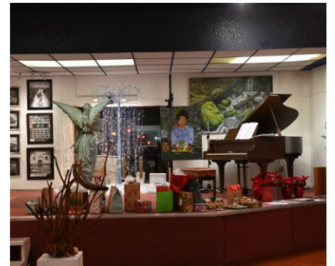
Stage all set for gift exchange