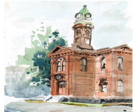
Old Dalles Courthouse